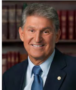
Hon. Joe Manchin (D)

US Senator, State of West Virginia, Ranking Member Senate Energy and Natural Resources Committee